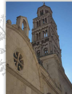
Cathedral of Saint Domnius

MTSM Conference Proceedings are since 2017 indexed in SCOPUS database (Elsevier).